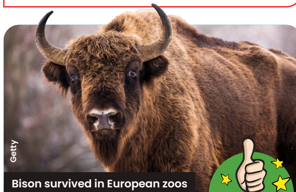
Bison survived in European zoos

It's a small but powerful step to protect both the planet and people. So, let's do this!