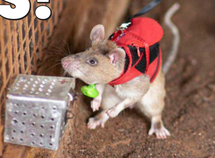
They're like real-life Detective Pikachu!

The researchers say that the rats are a cheaper way of finding these items than using expensive tech like X-rays.