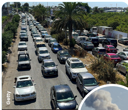
Above: cars queue to flee missiles hits Right: a missile hits

THOUSANDS in Lebanon have fled their homes, with the country under heavy fire from Israeli missiles.