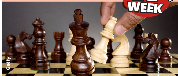
Russia's ally, Belarus, is banned, too