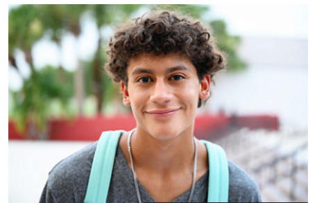
An example of good framing